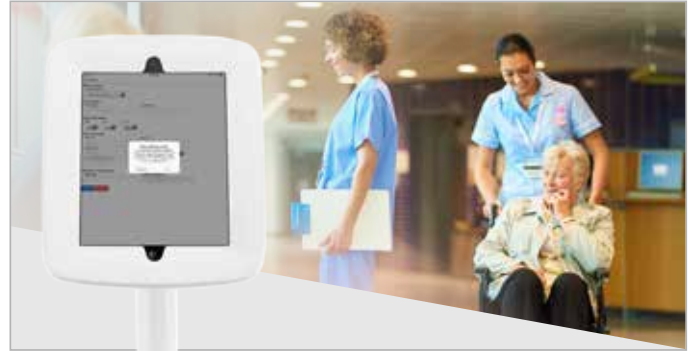
local hospitals and clinics