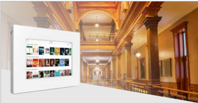
civic and recreation centers