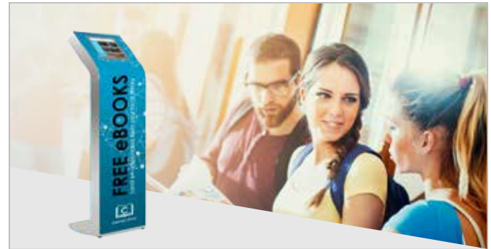
local schools and colleges