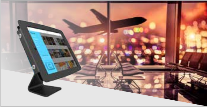
transit stations and airports